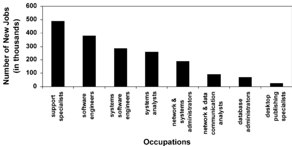
Figure 1. Estimated labor force demand for computer related jobs (Bureau of Labor Statistics, December 2001).

Even with revised projections because of a downswing in the overall US economy, demand for IT workers continues to exceed supply. Based on a survey of 532 IT hiring managers, ITAA (the Information Technology Association of America) predicts a shortfall of almost 600,000 skilled workers in 2002 (ITAA, 2002), positions that will go unfilled because of a lack of qualified applicants.