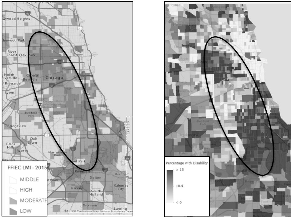
MAP 1 (LEFT): LMI NEIGHBORHOODS IN CHICAGO AREA 79 MAP 2 (RIGHT): PERCENTAGE WITH DISABILITY 80

city of Chicago and the Chicago Metropolitan Statistical Area, yet they make up 12% to 17% of some LMI neighborhoods. 78