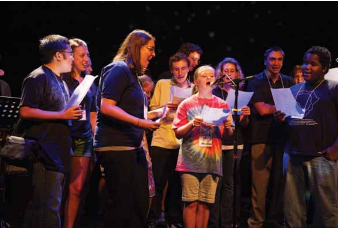
Syracuse-area students with disabilities, with the guidance of SU graduate students, perform their own musical masterpiece during a concert for the “SUMmer @ SUBcat” music program.